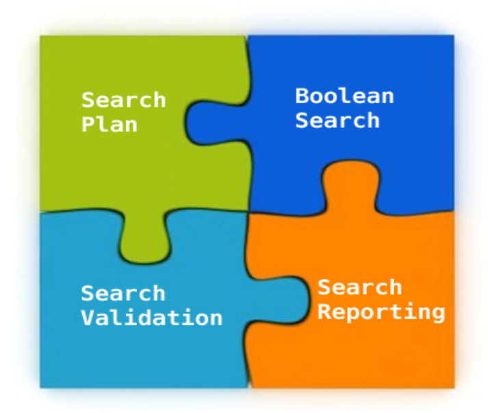
FIGURE 1: COMPONENTS OF AN SR SEARCH