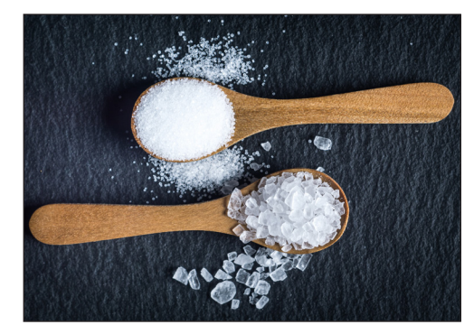
Different types of salt